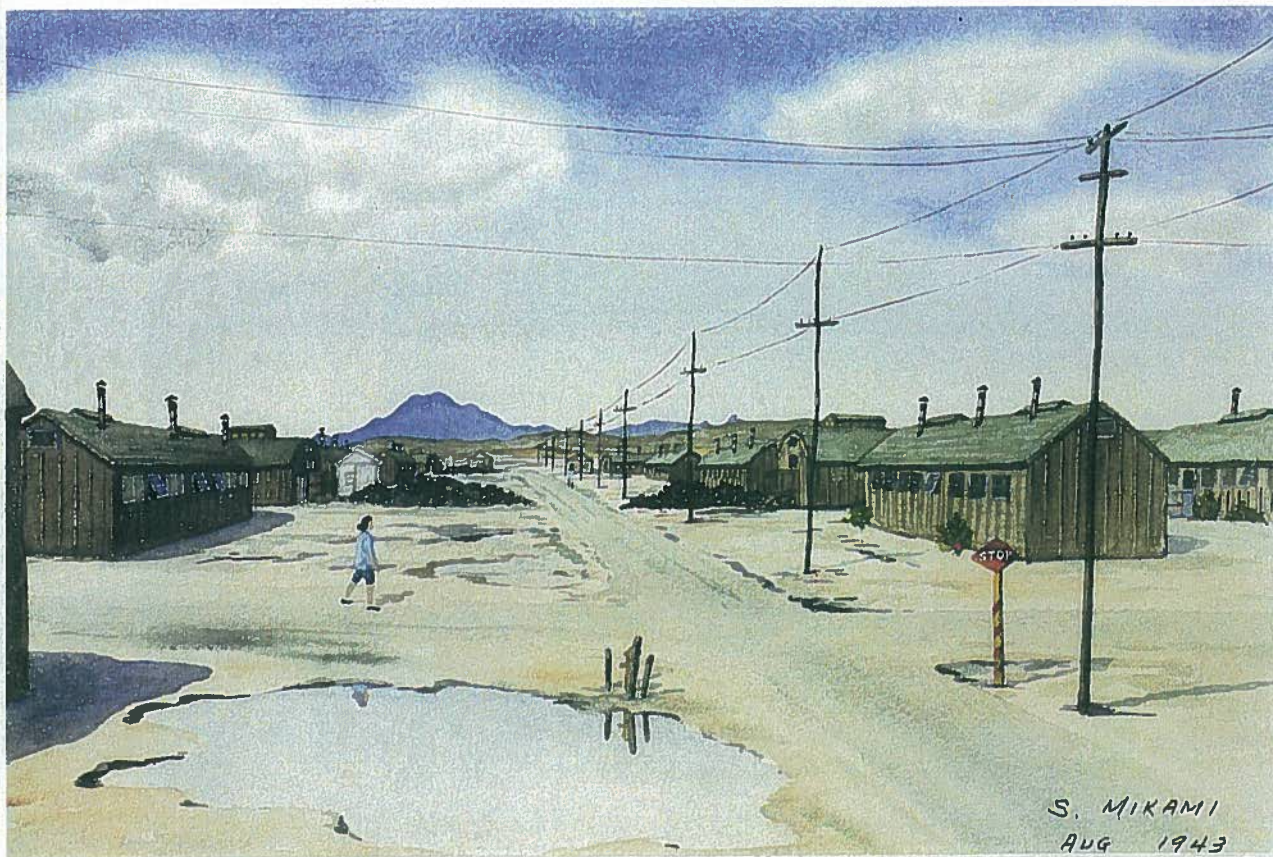
Japanese-American History Archives